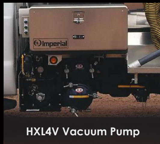
HXL4V Vacuum Pump