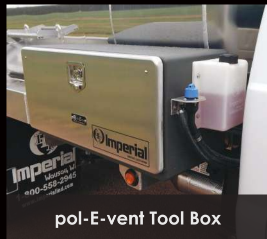
pol-E-vent Tool Box