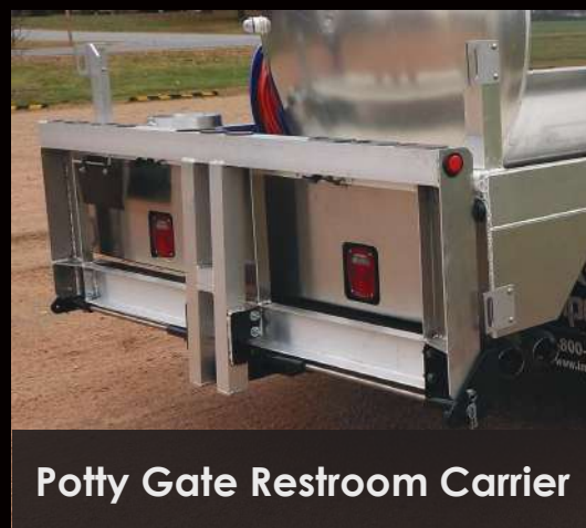
Potty Gate Restroom Carrier